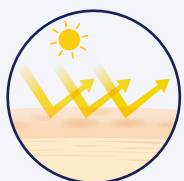
Soladel UV Shield Treated

Soladel UV Shield protects you round-the-clock from harmful UV rays. However, UPF can vary depending on the structure, thickness and material. The UPF needs to be determined on different textiles based on the closed textile surface.